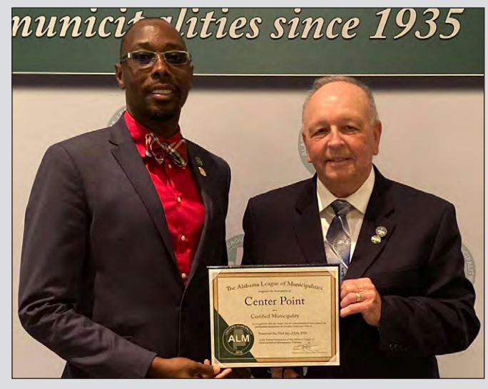
Ashford Center Point