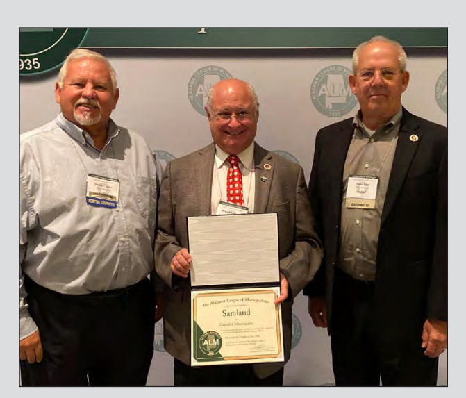
Foley Robertsdale Saraland